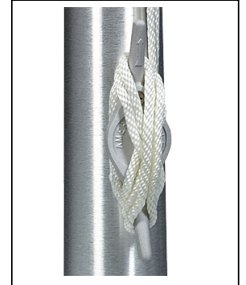
Heavy Duty Cleat