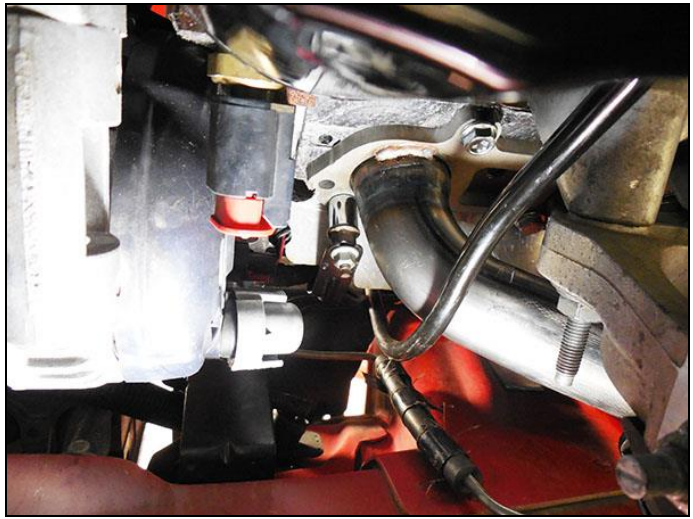
Figure 2 - Dipstick tube mounting bracket spacer w/ OEM bolt

NOTE: It is normal for your new Blackheart exhaust system to emit smoke for the first few minutes of operation.