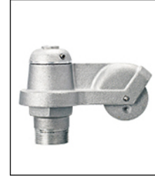
TRK-9610 In-Line Truck Single Revolving