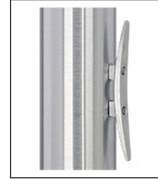
CLA-9090-SAT | 7' from bottom Cleat Only