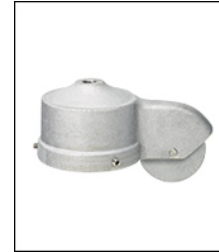
TRK-9301 External Single Stationary Aluminum Truck With Solid Aluminum Pulley

Note: Foundation design not included. Foundation dimensions should be determined by a qualified Engineer familiar with site soil conditions.