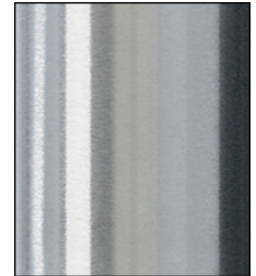
SAT Satin Finish