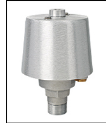
TRK-9660 Int. Revolving Truck Sealed Bearings