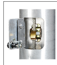
ICC - CAM CLEAT Flush Mount Hinged Door