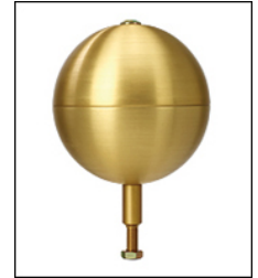
BAL-0512-GLD HD Gold Anodized Aluminum Ball