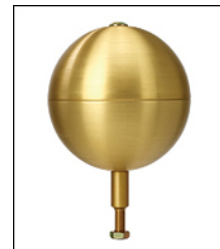
BAL-1058-GLD HD Gold Anodized Aluminum Ball