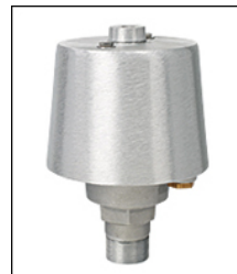
TRK-9800SS-58 Int. Rev. Sealed Truck SS Spindle