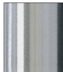
SAT Satin Finish