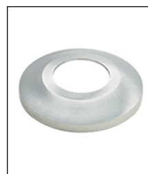
COL1-A10C FC-11 Cast Alum 1-Piece