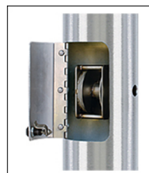
WINCH Flush Mount Door Frame