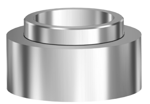
4x - Spacer

SuperATV strongly recommends using a Spring Compressor when removing and installing Springs.