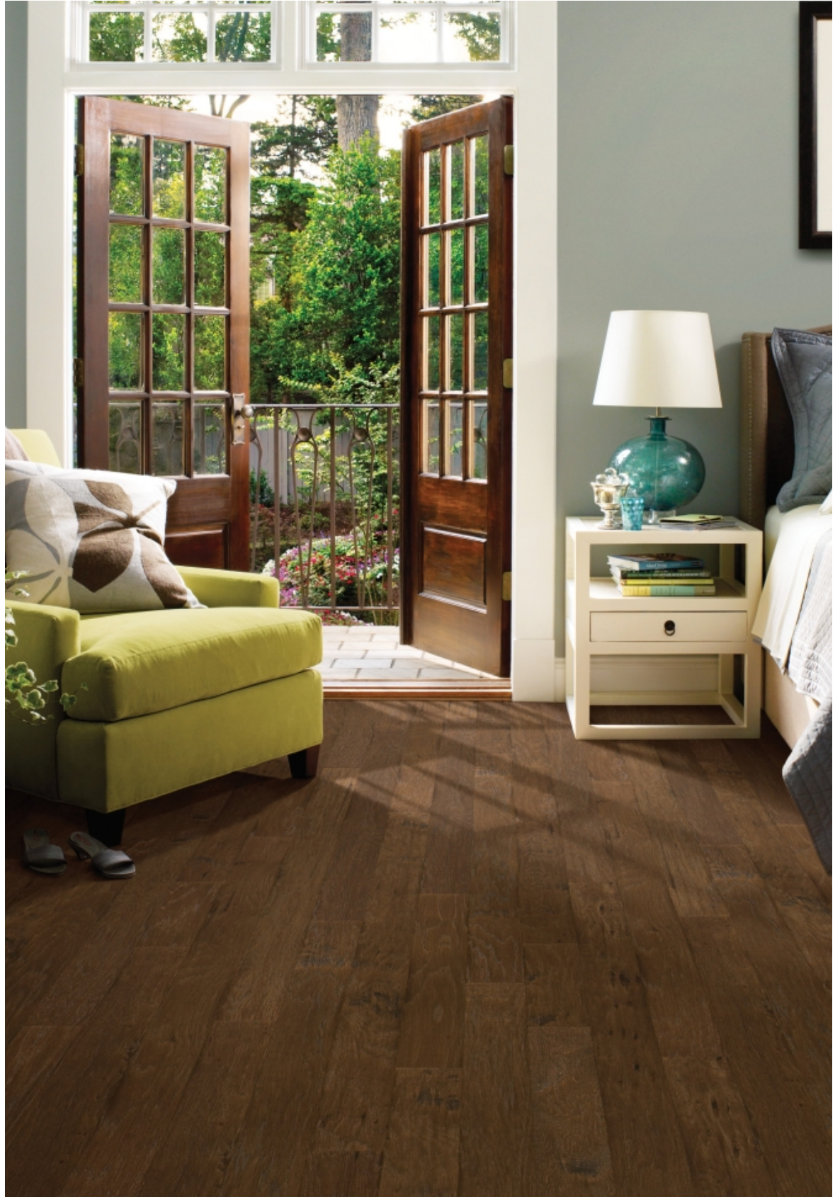
941 Weathered Saddle