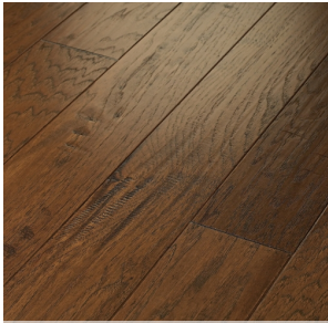
304 Burnt Barnboard