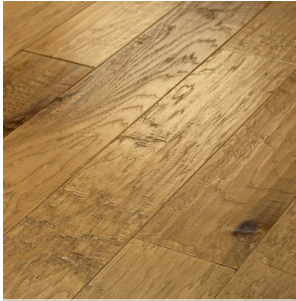
144 Prairie Dust