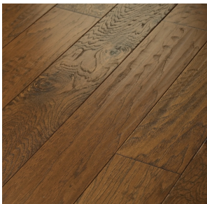
879 Warm Sunset