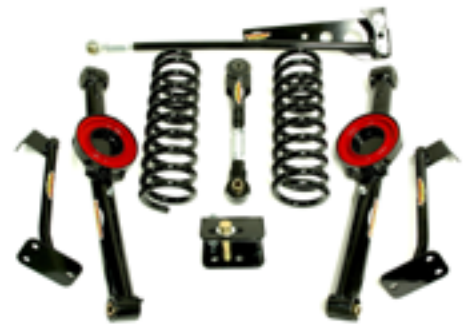
Rear kits above