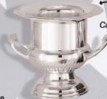
HW402 9" Champagne or Wine Cooler in Silver High Quality Polished Stainless Steel Can Be Mounted or Engraved