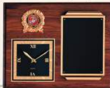
PS7350G 12 x 15" Walnut Plaque Clock with 2" Insert and Black Screened Brass Scroll Plate