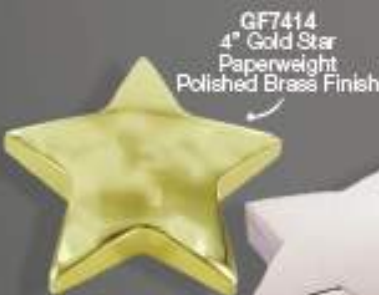
GF7414 4" Gold Star Paperweight Polished Brass Finish