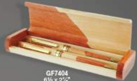
GF7404 6 1/2 x 2 1/4" Two-Toned Rosewood and Maple Ballpoint Pen and Pencil Boxed Set