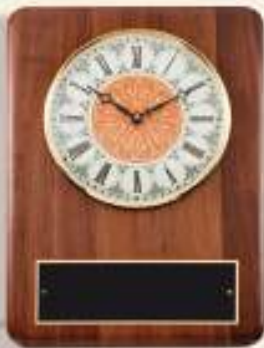
PN7542 11 x 15" Genuine Walnut Antique Quartz Clock Plaque with Black and Gold Engraving Plate