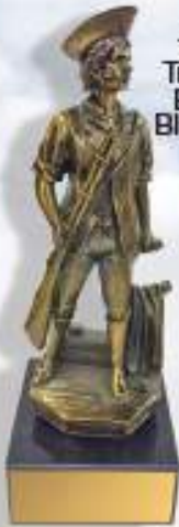
TR7993G 14" Minuteman Trophy in Antique Brass on Heavy Black Marble Base

Below we offer our high-quality line of metal clad military trophies with exceptional detail. They have a heavy electroplated coating of copper that is then plated in an antique brass or bronze finish. The figures include Minuteman, Navy Seaman, Fighter Pilot, Marine, and Soldier. The bases are either walnut finish, black wood, or black marble. The plates are either a matte gold finish or copper finish. Trophies are packed in a Styrofoam box. All pricing can be found in the centerfold along with the engraving price for each trophy.