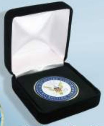
Black Velour Hinged Box X1500A: Holds 1 1/2 Coin" X1500B: Holds 1 3/4 Coin" X1500C: Holds 2 Coin"