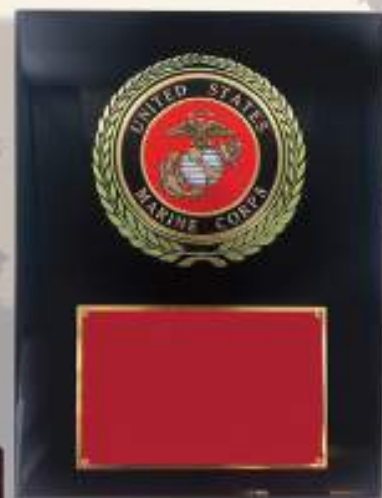
PN9703 9 x 12" U.S. Marine Corps Plaque with Gold Wreath which Holds 4" Medallion Insert Black Piano Finish Board Red and Gold Engraving Plate

Marine Corps Plaques, Multiple Sizes and Finishes