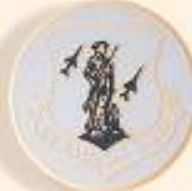
51/4055/G 2" Air National Guard Etched Enameled