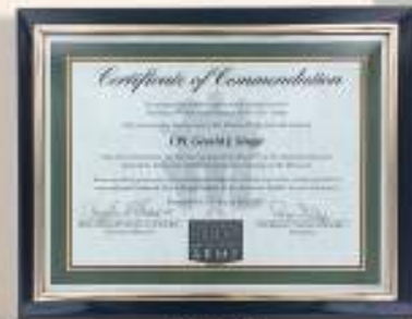
PN9673 9 x 12" Piano Finish Ebony Certificate Plaque with Gold Plexiglass Border