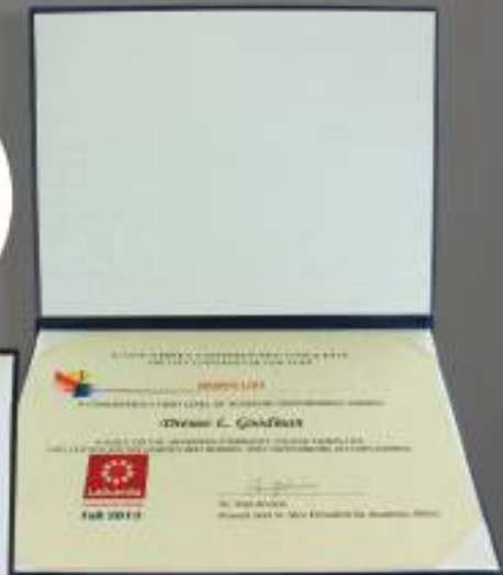
XC9670BL Blue Certificate Holder Padded Outer Cover White Satin Inside Cover Holds 8 1/2 x 11" Certificate