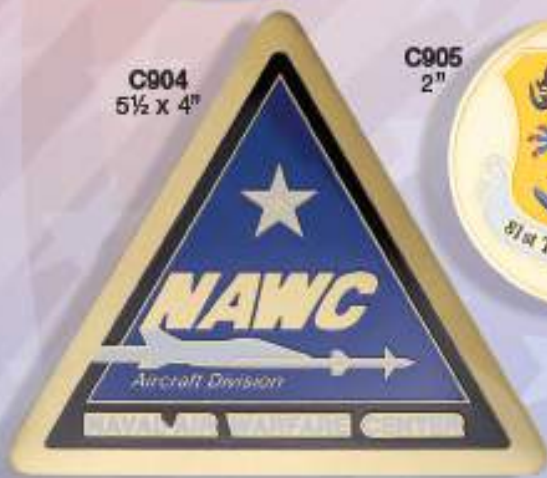
C904 5 1/2 x 4"