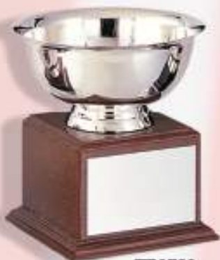
TR3723 6" Paul Revere Bowl High Quality Polished Stainless Steel on Walnut Finished Base Total Height w/Base: 7 1/4"

These high-quality awards are ideal for government agencies and military recognition. In addition, they are very popular for golf and tennis tournaments. All the items can be engraved with text and logos, along with the matte silver plates. The plates engrave black. Logo engraving will require an additional template charge which has to be quoted. The bases shown are either walnut finish or black wood. Pricing can be found in the centerfold along with the engraving price for each award. Logo pricing not shown, please inquire.