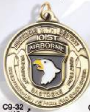
C9-32 1 1/2"