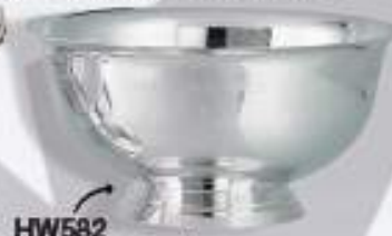
HW582 10" Paul Revere Bowl High Quality Polished Stainless Steel Can Be Mounted or Engraved