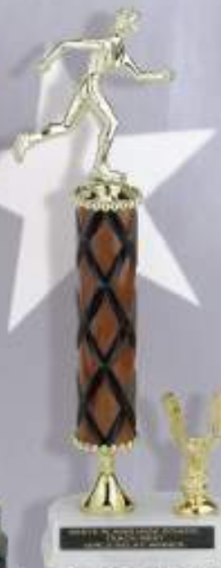
TR7160 A F2: 14½" TR7160 B F2: 15½" TR7160 C F2: 16½" Wood Turning