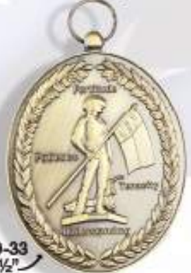
C9-33 2 1/2"