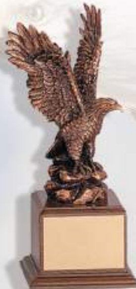
TR5135 15½" Eagle Trophy Bronze Electroplated with Walnut Finish Base