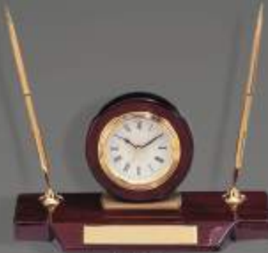
GF4881 6 x 9" Rosewood Piano Finish Desk Clock and Pen Set with Two Gold Pens and Quartz Clock