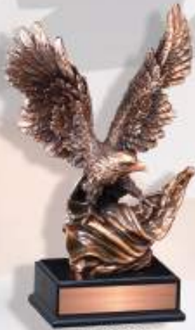
TR7452 19" Antique Bronze Eagle Trophy Bronze Electroplated with Black Wood Base

Antique Bronze American Eagle Patriot Trophy Series