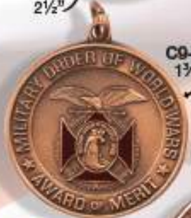
C9-35 1 3/4"