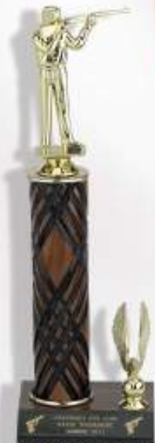
TR7158 A F2: 11" TR7158 B F2: 12" TR7158 C F2: 13" Wood Turning

Traditional Walnut Finish Carved Wood Column Trophies