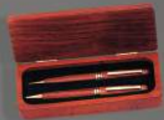
GF5274RO Deluxe Rosewood Finish Pen and Pencil Boxed Set with Black Velour Insert