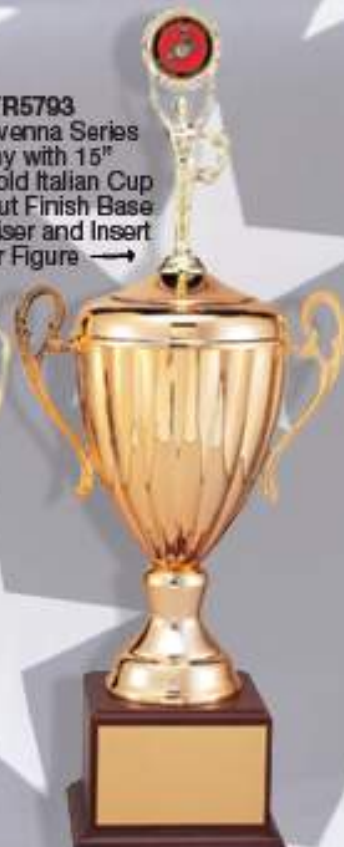
TR5793 27" Ravenna Series Trophy with 15" Metal Gold Italian Cup on Walnut Finish Base Takes Riser and Insert or Figure →