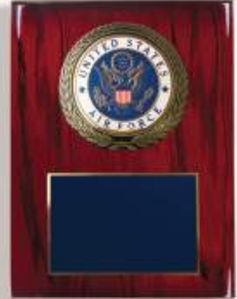
PN9768 9 x 12" U.S. Air Force Plaque with 4" Embossed Medallion Piano Cherry Finished Board Blue and Gold Engraving Plate