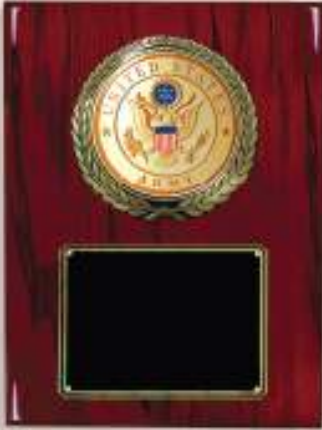
PN9734 9 x 12" U.S. Army Plaque with 4" Embossed Medallion Piano Cherry Finished Board Black and Gold Engraving Plate

Below we offer 4" embossed metal medallions showing four branches of the military. The medallions are mounted on either a piano finish cherry board or a genuine walnut board. The board sizes are either 8" x 10" or 9" x 12". The plate colors are black or blue with a gold border which matches the medallion. All plates engrave through in gold. Each plaque is individually packaged in a presentation box. All pricing can be found in the centerfold along with the engraving price for each plaque.