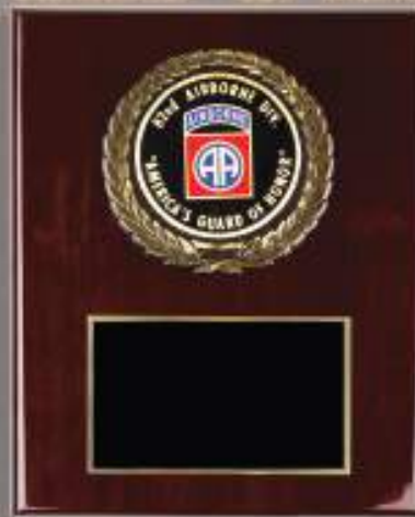
C9-52 8 x 10"