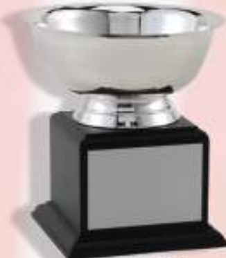
TR5117 6" Paul Revere Bowl High Quality Polished Stainless Steel on Black Wood Base Total Height w/Base: 7 1/4"