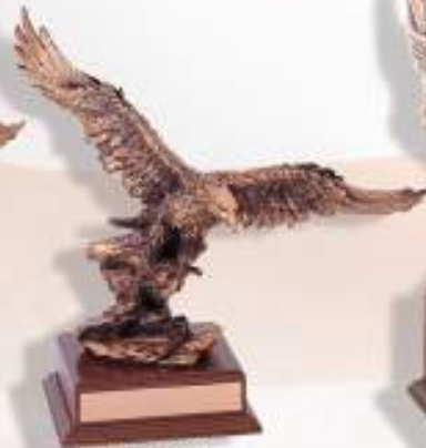
TR5308 14" Eagle Trophy Bronze Electroplated with Walnut Finish Base