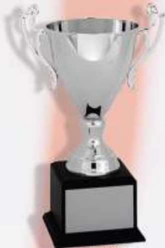
TR5510S 12 1/4" Ramona Series Trophy with 8 1/2" Metal Silver Italian Cup on Black Finish Base

Below are five different style trophy cups offered in a bright silver finish on black wood bases. The trophies are either shown with a matte silver plate (engraves black) or a black plate (engraves silver). You may change the color of the plate on each trophy. All cups are metal. Trophy figures are not available with this series. All pricing can be found in the centerfold along with the engraving price for each trophy.