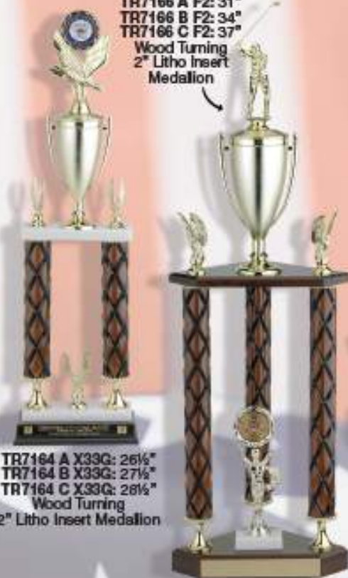
TR7164 A X33G: 26½" TR7164 B X33G: 27½" TR7164 C X33G: 28½" Wood Turning 2" Litho Insert Medallion