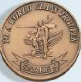
C90331 Back 2"