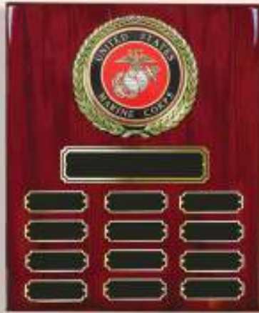
PN9751 10½ x 13" U.S. Marine Corps Perpetual Plaque with 4" Medallion Wreath Piano Finished Cherry Board Black and Gold Header Plate 12 Small Name Plates

The variety of Marine Corps plaques shown below include piano finish cherry wood, piano finish black wood and genuine walnut. The eagle castings are high relief three-dimensional antique brass. The medallion holders are metal high relief stampings. All the medallions are embossed printed aluminum inserts. The black and red plates engrave through in gold. All pricing can be found in the centerfold, along with the engraving price for each plaque.