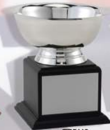
TR5119 8" Paul Revere Bowl High Quality Polished Stainless Steel on Black Wood Base Total Height w/Base: 9 1/4"