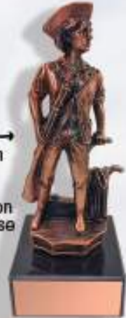
TR7992B 8 1/2" Minuteman Trophy in Electroplated Antique Bronze on Black Marble Base