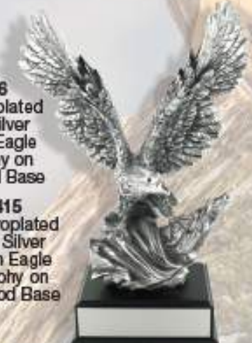
TR7415 14" Electroplated Antique Silver American Eagle Flag Trophy on Black Wood Base

Antique Silver American Eagle Patriot Trophy Series