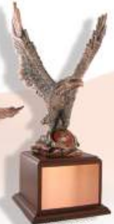
TR5139 15½" Eagle Trophy Bronze Electroplated with 2" Medallion Insert and Walnut Finish Base