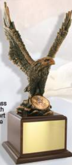
TR4062 15½" Antique Brass Eagle Trophy with 2" Medallion Insert and Walnut Base