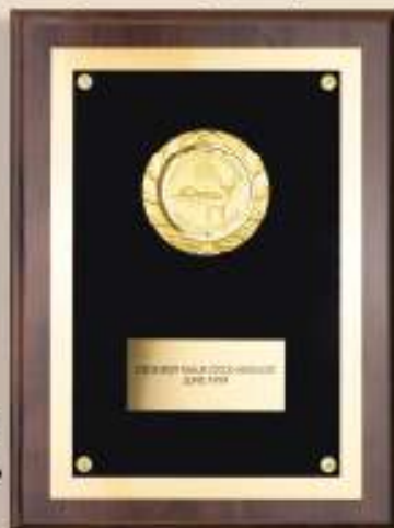
C9-45 9 x 12"