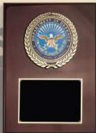
C9-47 8 x 10"