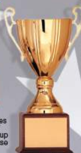
TR4814G 16½" Savoia Series Trophy with 12" Metal Gold Italian Cup on Walnut Finish Base