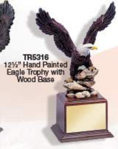
TR5316 12½" Hand Painted Eagle Trophy with Wood Base