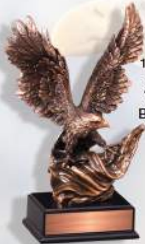
TR7451 14" Electroplated Antique Bronze American Eagle Flag Trophy on Black Wood Base