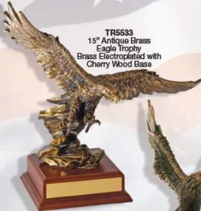
TR5533 15" Antique Brass Eagle Trophy Brass Electroplated with Cherry Wood Base

Below is our high-quality line of metal clad resin eagles. They have a heavy electroplated coating of copper that is then plated with an antique brass finish. The bases are walnut finish wood or black marble. The plates are a matte gold finish which engraves black. If you prefer, we can supply a black plate that engraves gold. The intricate detail and quality finish on the eagles is unmatched in our industry. Trophies are packed in a protective Styrofoam box. All pricing can be found in the centerfold along with the engraving price for each trophy.