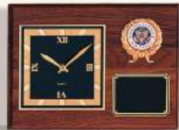
PS7351G 9 x 12" Walnut Plaque Clock with Metal Wreath Holding 2" Insert and Black Screened Plate