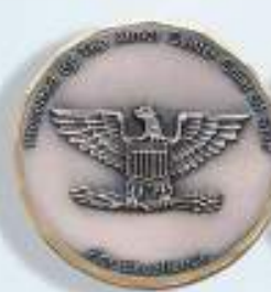
C90334 Front 1 3/4"