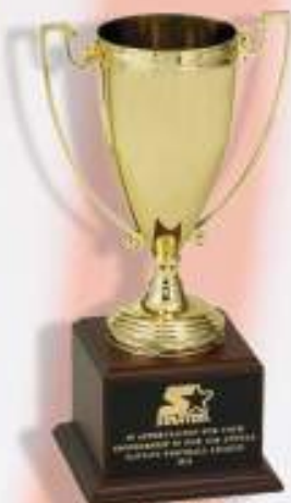
TR5909G 12" Trophy with 8¼" Gold Cup on Walnut Wood Base