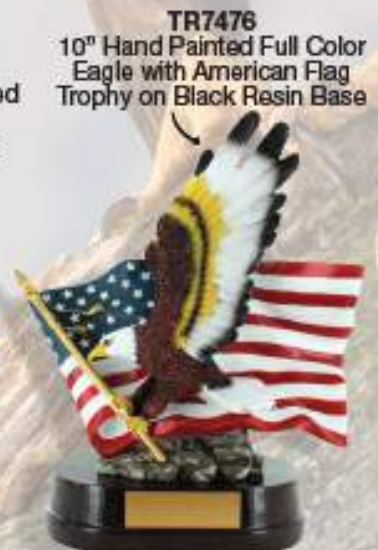
TR7476 10" Hand Painted Full Color Eagle with American Flag Trophy on Black Resin Base

Hand Painted Full Color American Eagle and Flag Trophies