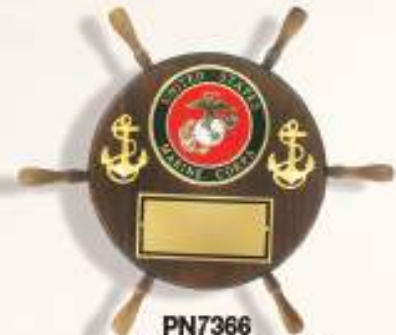
PN7366 13" Genuine Walnut Ship Wheel Plaque with U.S. Marine Corps Medallion and Gold Engraving Plate