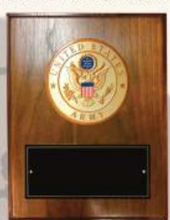
PN9730 8 x 10" U.S. Army Plaque with 4" Embossed Medallion Walnut Veneer Board Black and Gold Engraving Plate