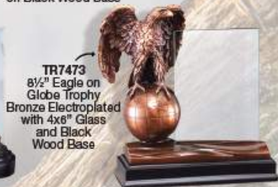
TR7473 8 1/2" Eagle on Globe Trophy Bronze Electroplated with 4x6" Glass and Black Wood Base

Antique Bronze American Eagle and Flag Patriot Trophy Series