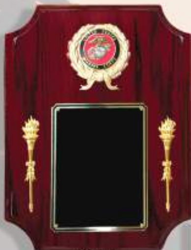
PN9692 9 x 12" Beveled Corners Plaque with Gold Wreath which Holds 2" Military Insert Piano Finished Cherry Board Black and Gold Engraving Plate