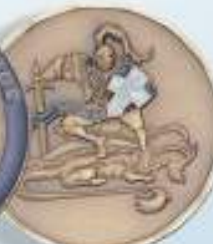
C90332 Back 1 3/4"