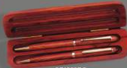
GF4888RO Rosewood Ballpoint Pen and Pencil Boxed Set