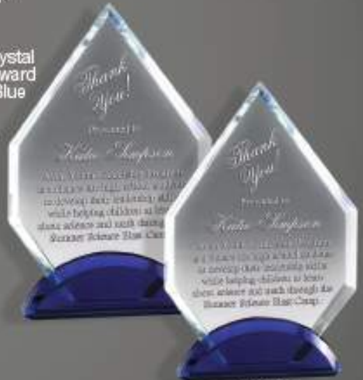
CR360 7" Optical Crystal Arrowhead Award on Double Blue Base