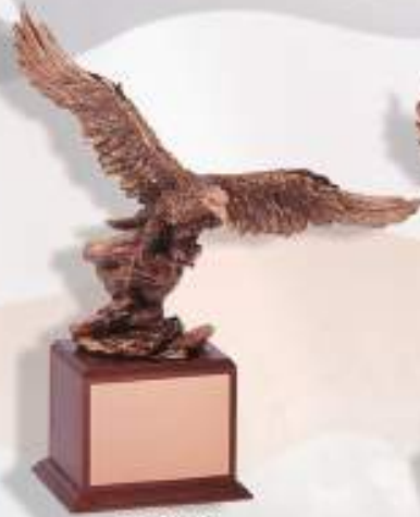
TR5386 18½" Eagle Trophy Bronze Electroplated with Walnut Finish Base