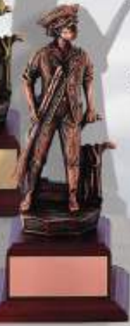
TR5390 9 1/2" Minuteman Trophy in Electroplated Antique Bronze on Walnut Base