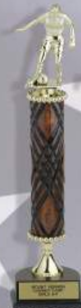
TR7157 A F2: 13" TR7157 B F2: 14" TR7157 C F2: 15" Wood Turning