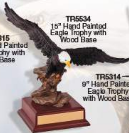
TR5534 15" Hand Painted Eagle Trophy with Wood Base