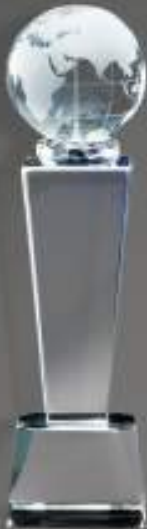
CR310 8 3/4 x 2 1/2" Optical Crystal Globe Column Trophy

The selection below consists of some of our most popular crystal awards. You will find many more on our website. The crystal is lead free and is laser engraved with text and logos. Some of the items come in multiple sizes which are listed below. All items are delivered in a deluxe presentation box. Pricing can be found in the centerfold along with the engraving price for text and logos.