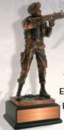
TR7242 11 1/2" Army Soldier Trophy in Electroplated Bronze on Black Base