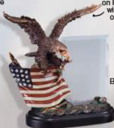
TR7465 10" Electroplated Bronze Eagle on Painted American Flag with 4x6" Glass Trophy on Black Wood Base