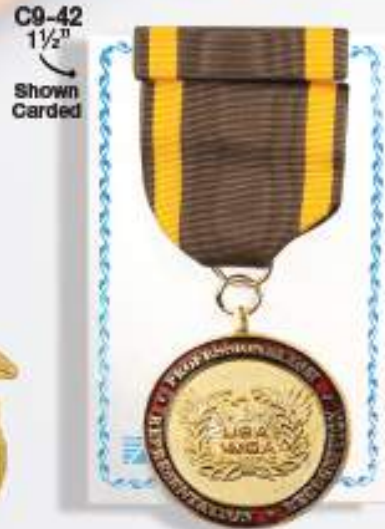
C9-42 1 1/2" Shown Carded