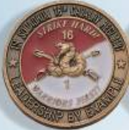
C90331 Front 2"