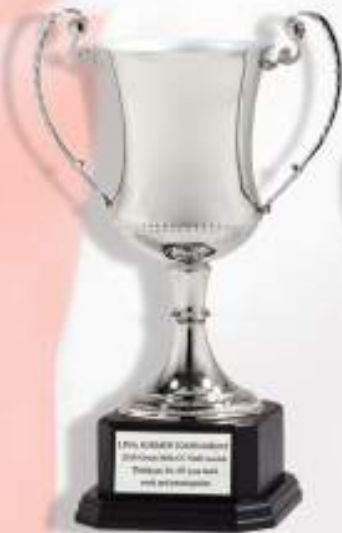
TR7578 13" Nickel Plated Silver Trophy Cup Die Cast Zinc Polish on Black Wood Base