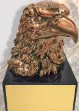
TR7988 6" Antique Brass Eagle Head Trophy Brass Electroplated with Black Marble Base