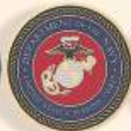
51/7803/G 2" Department of the Navy U.S. Marine Corps Etched Enameled