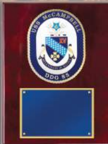
C9-51 9 x 12"