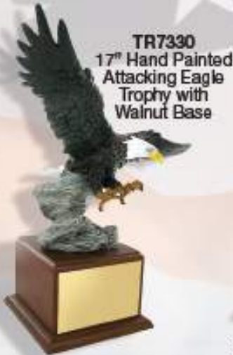
TR7330 17" Hand Painted Attacking Eagle Trophy with Walnut Base

Below we offer our intricately hand painted resin eagle and American Flag trophies. The bases are walnut finish or resin. All plates are a matte gold finish that engraves black. Two trophies hold a 2" medallion insert which you must choose from page 13. Trophies are packed in a protective Styrofoam box. All pricing can be found in the centerfold along with the engraving price for each trophy.