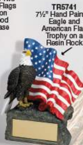
TR5741 7½" Hand Painted Eagle and American Flag Trophy on a Resin Rock