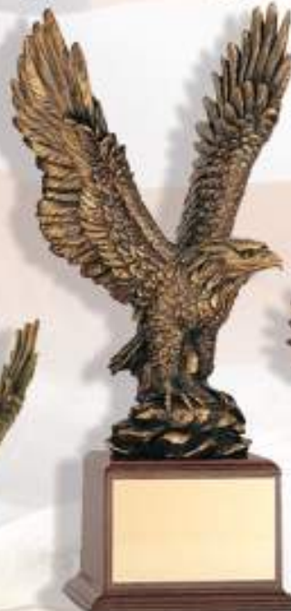
TR4145 15½" Antique Brass Eagle Trophy Brass Electroplated with Walnut Base