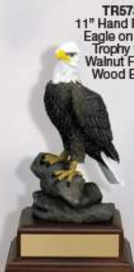
TR5739 11" Hand Painted Eagle on Rock Trophy with Walnut Finish Wood Base