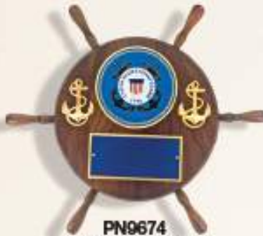
PN9674 13" Genuine Walnut Ship Wheel Plaque with U.S. Coast Guard Medallion and Blue Engraving Plate