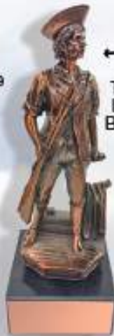
TR7994B 14" Minuteman Trophy in Antique Bronze on Heavy Black Marble Base