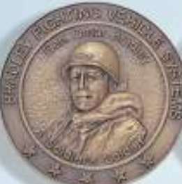
C90341 Front 2"