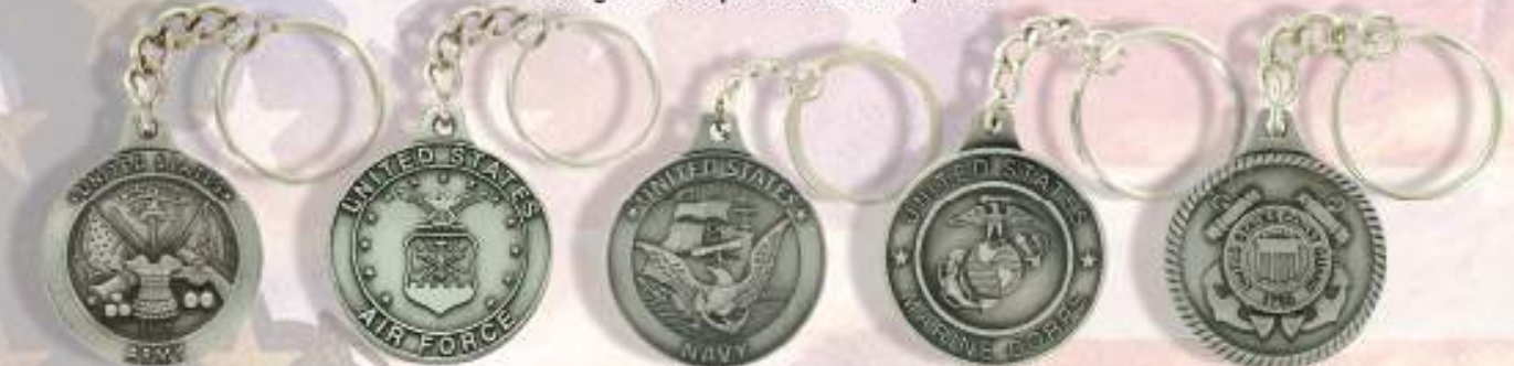
PK109 1½" United States Army Pewter Keychain

Below is an assortment of key chains, ceramic coffee mugs, glass mugs, travel mugs and coasters. We can personalize the backside of the key chains and all the drinkware. The coasters are available with all our 2" medallion inserts found on page 13. The mugs can be personalized by us with name and rank. All pricing can be found in the centerfold along with the personalization price.