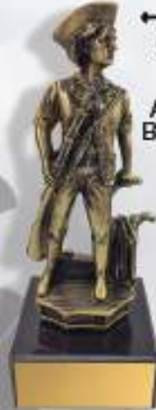
TR7991G 8 1/2" Minuteman Trophy in Electroplated Antique Brass on Black Marble Base