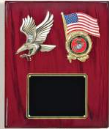
PS9693 10½ x 13" Eagle with American Flag Plaque with 4" Antique Brass Eagle and 2" Medallion Insert Piano Finished Cherry Board Black and Gold Engraving Plate