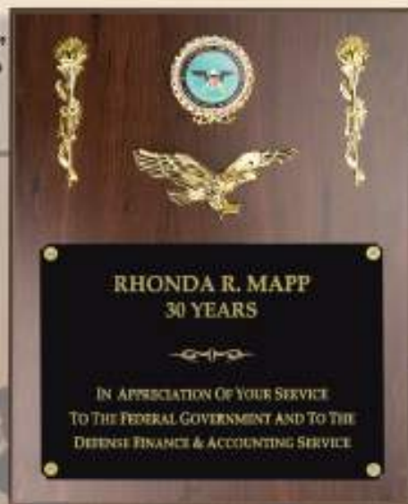
C9-48 12 x 15"