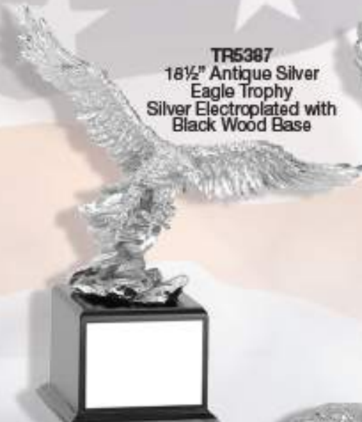
TR5387 18½" Antique Silver Eagle Trophy Silver Electroplated with Black Wood Base