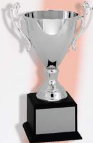
TR5513S 18" Ramona Series Trophy with 13 1/2" Metal Silver Italian Cup on Black Finish Base