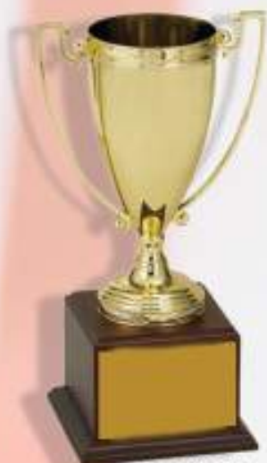
TR5175GD 17½" Trophy Cup with Gold Plate on Walnut Finish Base

Below are three different style trophy cups offered in a gold finish on a walnut finish wood base. The trophies are shown with a matte gold or black engraving plate. The color of the plates can be changed on each trophy. The engraving on the gold plates shows through in black and the engraving on the black plates shows through in gold. Both the stem and the cup are metal. One of the trophies shows a sports figure and one shows a 2" medallion. All figures and medallions are interchangeable. We can also offer any of the other cups with a lid and figure, which must be quoted. The medallion selection can be found on page 13. We carry over 150 trophy figures, including every sport. All pricing can be found in the centerfold along with the engraving price for each trophy.