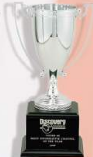
TR5909S 12" Trophy with 8 1/4" Heavy Silver Metal Cup on Black Wood Base