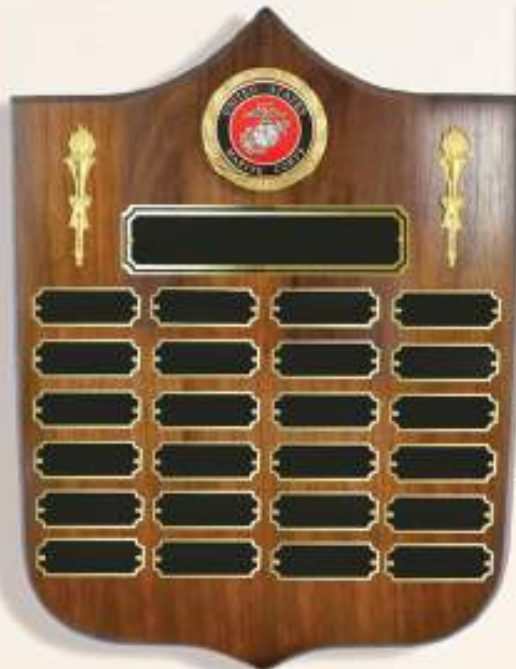
PN9699 12 x 16" Perpetual Shield Plaque with 2" Interchangeable U.S. Military Medallion Insert and Double Wreath Torches Genuine Walnut Board Black and Gold Header Plate 12 Small Name Plates