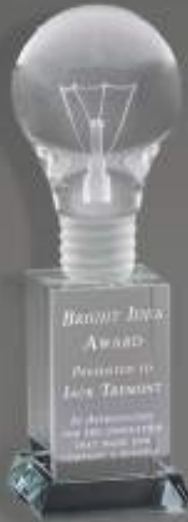
CR464 8 x 2 1/2" Optical Crystal Light Bulb Award