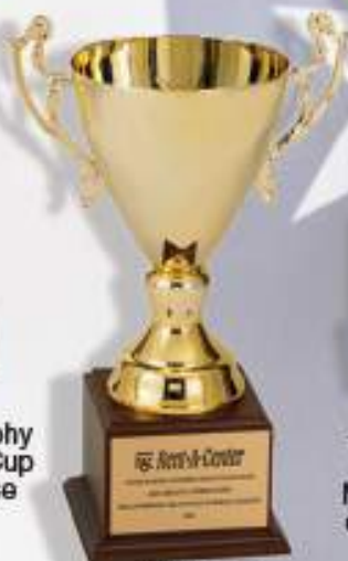
TR5513G 18" Ramona Series Trophy with 13½" Metal Gold Italian Cup on Walnut Finish Base