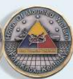
C90334 Back 1 3/4"