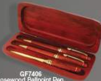
GF7406 Rosewood Ballpoint Pen, Pencil, and Letter Opener Boxed Set