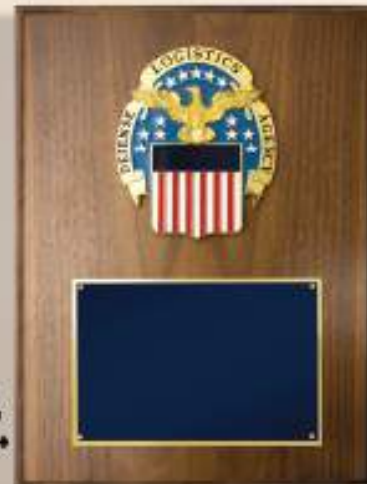
C9-46 9 x 12"