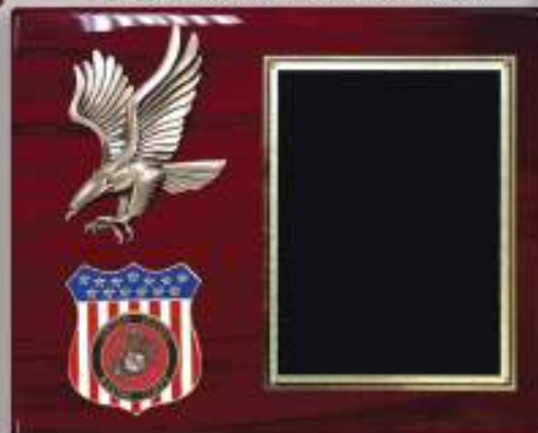
PN9707 8 x 10" Eagle and American Shield Plaque with 4" Antique Brass Eagle and American Flag Shield Emblem which Holds 2" Medallion Insert Piano Finished Cherry Board Black and Gold Engraving Plate