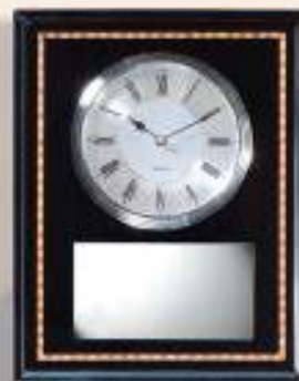
PN7418 13 x 10" Black Piano Finish Plaque with Clock and Silver Engraving Plate