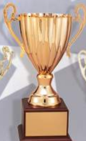
TR5800G 16½" Ravenna Series Trophy with 12¼" Metal Gold Italian Cup on Walnut Finish base