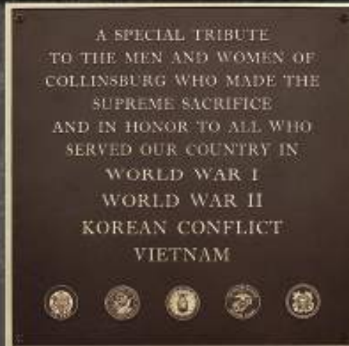
Bronze Plaque 30 x 30"