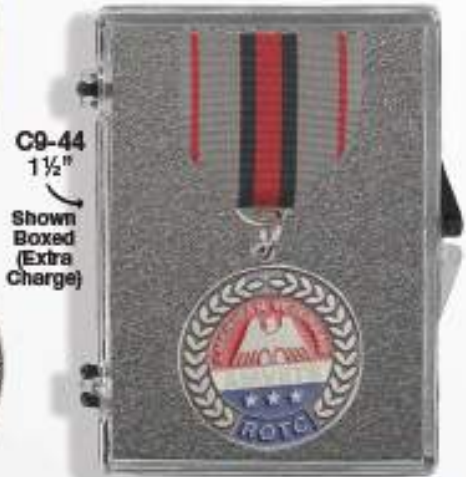
C9-44 1 1/2" Shown Boxed (Extra Charge)