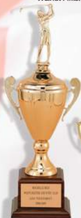
TR4801G 18" Savoia Series Trophy with 8½" Metal Gold Cup on Walnut Finish Base Takes Figure