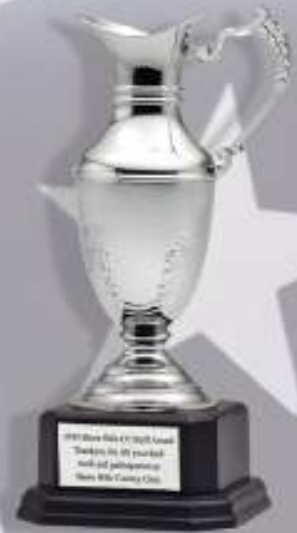
TR7562 12 1/2" Nickel Plated Polished Silver Claret Jug Cup on Black Base

Silver Trophy Cups on Wood Bases: English, American & Italian Made Quality