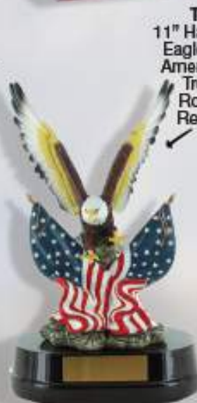
TR7478 11" Hand Painted Eagle with Two American Flags Trophy on Rosewood Resin Base