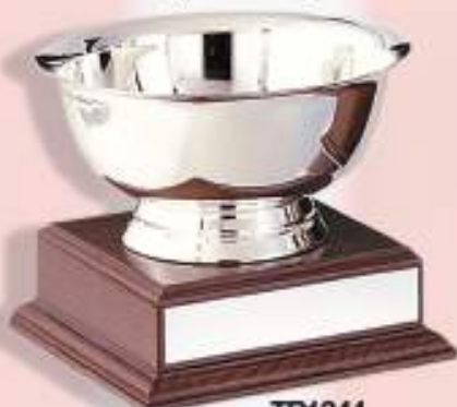
TR1344 6" Paul Revere Bowl High Quality Polished Stainless Steel on Walnut Finished Base Total Height w/Base: 5 3/4"