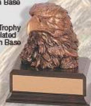
TR5138 6½" Eagle Head Trophy Bronze Electroplated with Walnut Finish Base