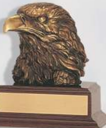
TR4651 6" Antique Brass Eagle Head Trophy Brass Electroplated with Walnut Base