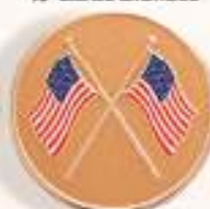
49/1771/G 2" Crossed American Flags Litho