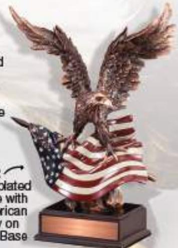
TR7472 12 1/2" Electroplated Bronze Eagle with Painted American Flag Trophy on Black Wood Base