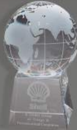
CR136 6" Optical Crystal Globe on Base Award Globe Diameter is 4"