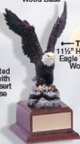
TR5315 11½" Hand Painted Eagle Trophy with Wood Base