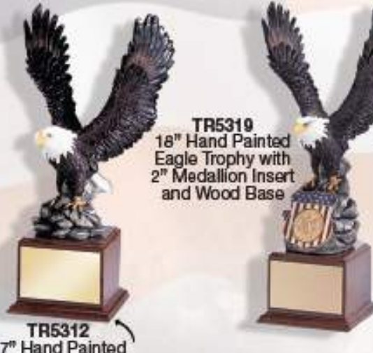
TR5319 18" Hand Painted Eagle Trophy with 2" Medallion Insert and Wood Base