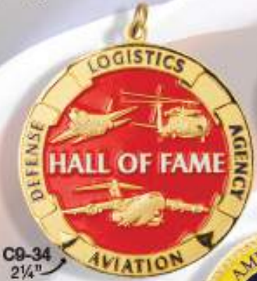
C9-34 2 1/4"