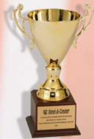
TR5510G 12¼" Ramona Series Trophy with 8½" Metal Gold Italian Cup on Walnut Finish Base