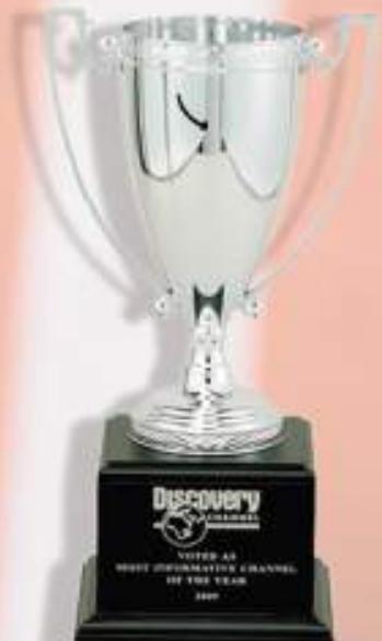
TR5911S 17 1/2" Trophy with 13" Heavy Silver Metal Cup on Black Wood Base