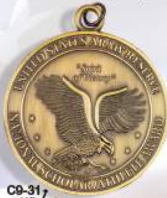
C9-31 2 1/2"