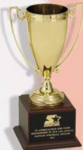
TR5911G 17½" Trophy with 13" Gold Cup on Walnut Wood Base