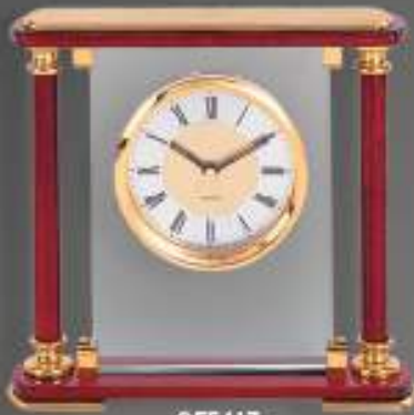
GF5417 7 x 7" Rosewood Piano Finish Mantel Quartz Movement Clock with Glass Insert and Polished Brass Accents

We offer a variety of desk items including clocks, pen sets, paperweights and certificate holders. These are our most popular desk items but are only a small selection of our total offerings. Please go to our website to see our entire selection. Each item is designed to allow logo and text engraving. Pricing can be found in the centerfold along with the engraving price.