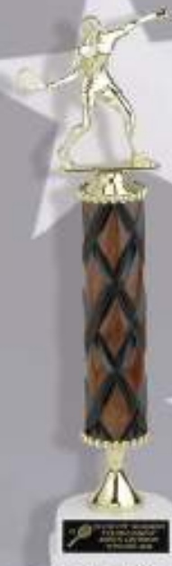
TR7159 A F2: 13" TR7159 B F2: 14" TR7159 C F2: 15" Wood Turning