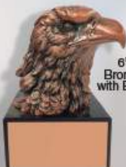
TR7990 6" Eagle Trophy Bronze Electroplated with Black Marble Base