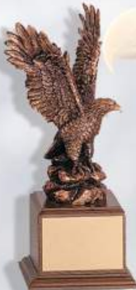
TR5136 12" Eagle Trophy Bronze Electroplated with Walnut Finish Base