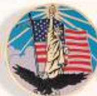
49/5335/G 2" Statue of Liberty Litho