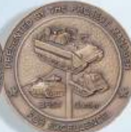
C90341 Back 2"