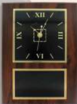
PN7419 9 x 12" Walnut Finish Plaque with Clock and Black Screened Plate