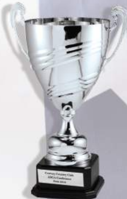
TR7556 21 1/2" Bright Polished Silver Metal Italian Trophy Cup on Ebony Wood Base