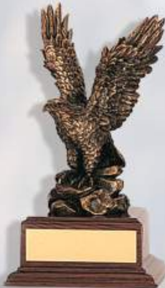
TR4649 8½" Antique Brass Eagle Trophy Brass Electroplated with Walnut Base