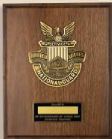
C9-44 8 x 10"

The variety of plaques below represent several different manufacturing methods. Some of them are made under contracts with individual agencies and military units. The boards include genuine walnut, walnut finish, piano finish rosewood, cherry boards and a black piano finish board. The medallions and emblems are either die cast three-dimensional, etched soft enameled brass, or die struck stamped. We can supply any color engraving plate needed. In addition, we do all the personalization for each plate. Additional size boards are available. Pricing will be based on quantity and method of production. We will provide a quote the same day based on your specifications.