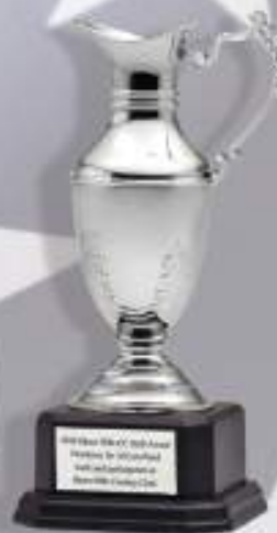
TR7561 10" Nickel Plated Polished Silver Claret Jug Cup on Black Base