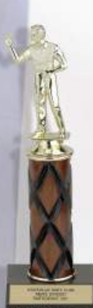
TR7156 A F2: 10" TR7156 B F2: 11" TR7156 C F2: 12" Wood Turning