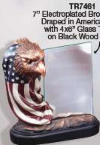
TR7461 7" Electroplated Bronze Eagle Draped in American Flag with 4x6" Glass Trophy on Black Wood Base