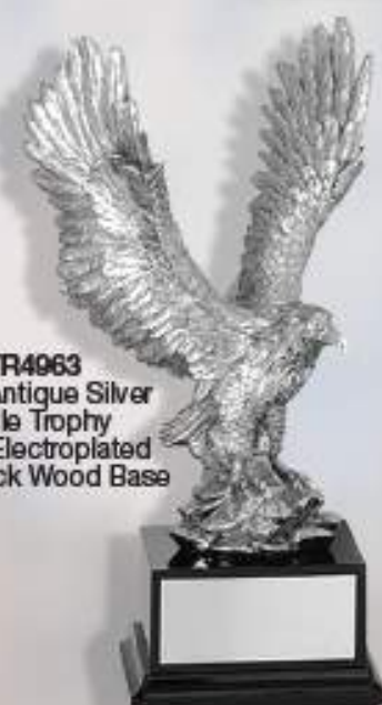
TR4963 15½" Antique Silver Eagle Trophy Silver Electroplated with Black Wood Base