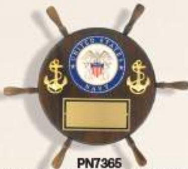
PN7365 13" Genuine Walnut Ship Wheel Plaque with U.S. Navy Medallion and Gold Engraving Plate

Below we offer our genuine walnut ship wheel plaques for the Navy, Marines, and Coast Guard. In addition, we show five clock plaques in genuine walnut, walnut finish and a black filigree piano finish. There are also three styles of plaque certificates. All certificates slide in from the side. All pricing can be found in the centerfold along with the engraving price for each plaque.