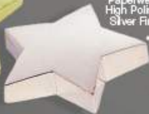
GF5202 4" Silver Star Paperweight High Polished Silver Finish