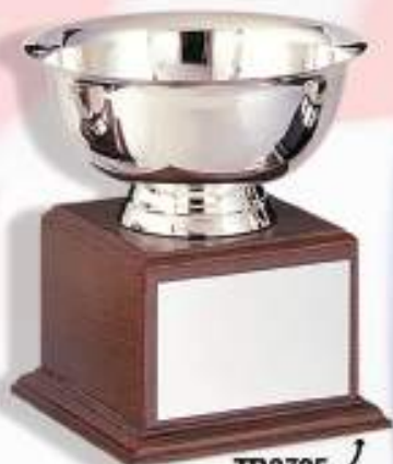
TR3725 8" Paul Revere Bowl High Quality Polished Stainless Steel on Walnut Finished Base Total Height w/Base: 9 1/4"