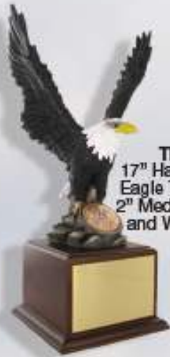
TR5313 17" Hand Painted Eagle Trophy with 2" Medallion Insert and Wood Base