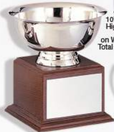
TR3726 10" Paul Revere Bowl High Quality Polished Stainless Steel on Walnut Finished Base Total Height w/Base: 10 1/2"