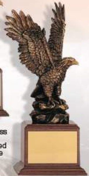
TR4149 12" Antique Brass Eagle Trophy Brass Electroplated with Walnut Base