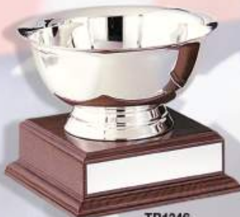
TR1346 8" Paul Revere Bowl High Quality Polished Stainless Steel on Walnut Finished Base Total Height w/Base: 6 1/2"