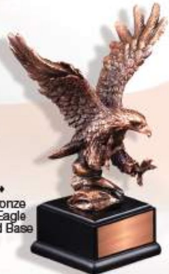
TR7454 7 1/2" Electroplated Bronze Attacking American Eagle Trophy on Black Wood Base