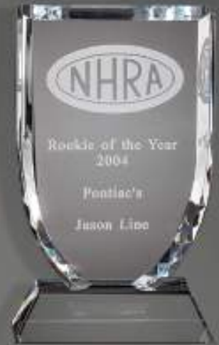
CR143 8 x 5 1/2" Optical Crystal Shield Award