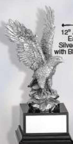
TR4964 12" Antique Silver Eagle Trophy Silver Electroplated with Black Wood Base