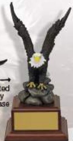
TR5314 9" Hand Painted Eagle Trophy with Wood Base