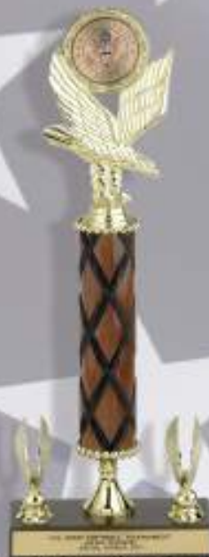
TR7161 A X33G: 15½" TR7161 A X33G: 16½" TR7161 A X33G: 17½" Wood Turning 2" Litho Insert Medallion