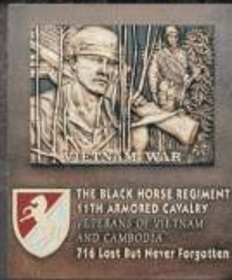
Enamel Bronze Plaque 16 x 20"