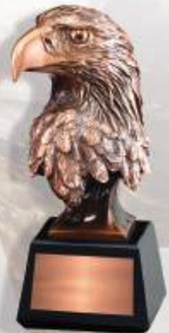
TR7474 8" Bronze Plated American Eagle Head Trophy on Black Wood Base