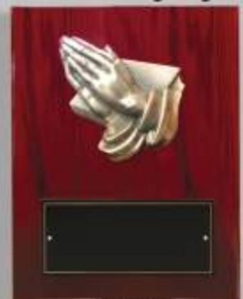
PN9697 8 x 10" Praying Hands Plaque Piano Cherry Finished Board Black and Gold Engraving Plate