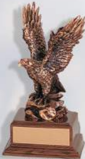
TR5137 8½" Eagle Trophy Bronze Electroplated with Walnut Finish Base