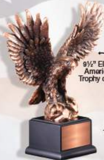
TR7456 9 1/2" Electroplated Bronze American Eagle on Rock Trophy on Black Wood Base