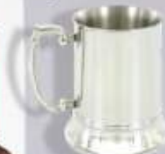
HW598 16 Oz. Double Wall Stainless Steel Tankard High Polished 5x4" Tankard Can Be Engraved