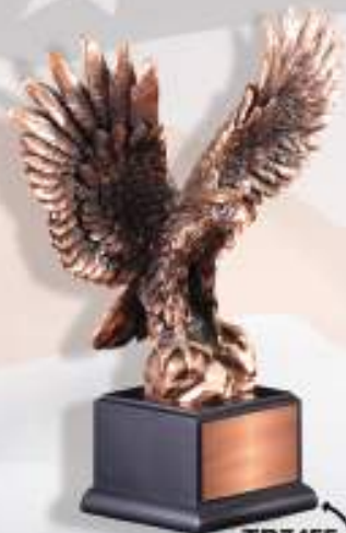
TR7455 4 3/4" Electroplated Bronze American Eagle on Rock Trophy on Black Wood Base

Below we offer our high-quality line of metal clad resin eagles. They have a heavy electroplated coating of copper that is then antiqued to give a bronze finish. Some of the eagles have a hand painted American Flag with a glass insert which we engrave with text and a logo. The other trophies have a copper like plate which engraves black. The intricate detail and quality finish on the eagles are unmatched in our industry. Trophies are packed in a protective Styrofoam box. All pricing can be found in the centerfold along with the engraving price for each trophy.