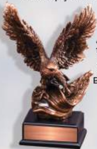
TR7450 10" Electroplated Antique Bronze American Eagle Flag Trophy on Black Wood Base