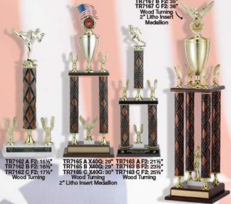
TR7162 A F2: 15½" TR7162 B F2: 16½" TR7162 C F2: 17½" Wood Turning