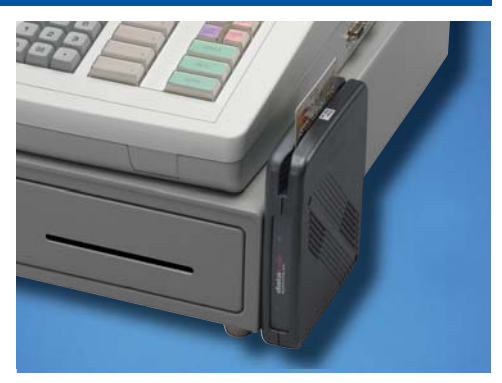
DataTran™ Integrated Credit Option